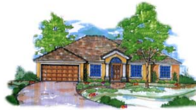
Total Square Feet - 2890

It can be a daunting task to remodel a home, build a new house or construct new office space. The project requires a keen knowledge of construction principles, local and country ordinances and the material and labor costs involved. Without this information and the professionals to put a plan into motion, financial disaster can occur. We at Archstone Real Estate can provide the level of comfort you need to know that your project is being done right, the way you want it, at the lowest cost possible.